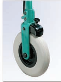
SLOW DOWN BRAKE