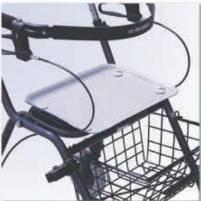
FOOD & BEVERAGE TRAY