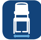
Total width ▼