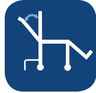
Tilt angle back ▼