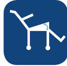
Tilt angle seat ▼