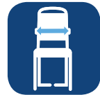
Width between armrests ▼