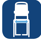
Seat width ▼

For more comprehensive information about this product, including the product's user manual, please see your Clarke Health Care rep or Aquatec dealer.