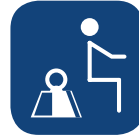
Load capacity ▼