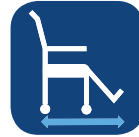
Total depth ▼