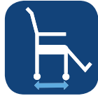
Seat depth ▼