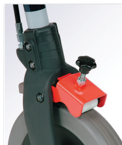
SLOW DOWN BRAKE