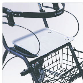
FOOD & BEVERAGE TRAY