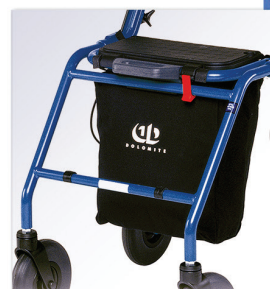
UNDER SEAT BAG