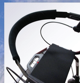
SEAT AND BACK PAD

Accessories enhance the use of your rollator, the Tray gives you a surface to carry food, the Oxygen Tank holder will safely support tanks sizes B, C, D, E. A Cane Holder can secure a cane or crutch to the side of our rollator. Slow-Down Brakes have tension control to allow individual setting on each tire. One-Hand Brakes control braking from one handle. Under-Seat bag offers a place to stash items out of sight. Tall Handles add additional height. Cross-Bar combines a forward push bar grip area with one-hand braking.