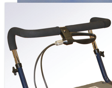
CROSS BAR WITH BRAKE