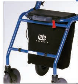
UNDER SEAT BAG