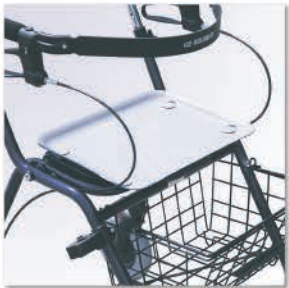
FOOD & BEVERAGE TRAY