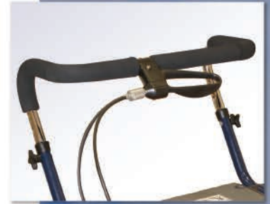
CROSS BAR WITH BRAKE