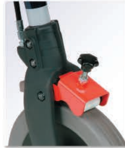
SLOW DOWN BRAKE