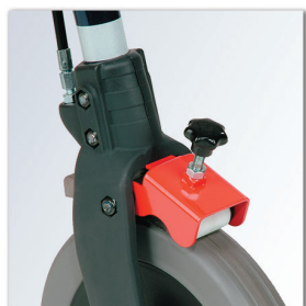
SLOW DOWN BRAKE