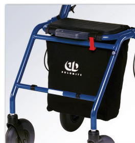
UNDER SEAT BAG