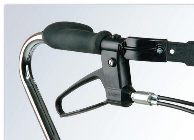
ONE HAND BRAKE