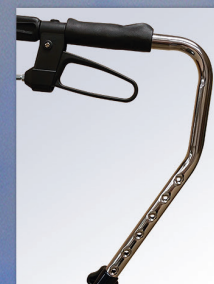
TALL HANDLES MAXI+