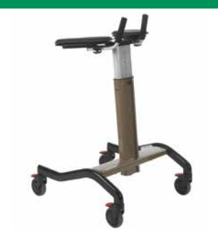
Manual Pull out the pin, move to required position, release the pin.