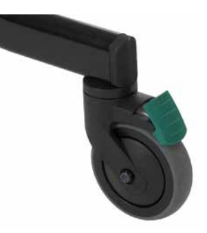
Swivel caster with directional brakes Helps focus on walking instead of direction. Locks out swivel on caster. Part no D1531408

Gives security and makes it possible for the user to start the gait training earlier. No tools needed. Easy to fit and adjust, quick release. Part no D1536846