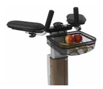
Practical basket Keeps belongings within easy to reach range. Part no D1531390