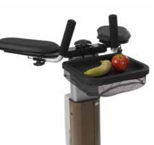
Tray For small things .Fits on basket. Part no D1531391

Brake systemFor the user capable of operatingbrake function.Hand-brake kitPart no D1537656One-hand brakePart no RightD1539513Part no LeftD1531450