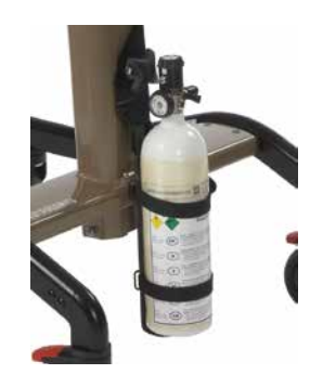
Oxygen tank holder Secure mounting of oxygen tank on the walker. Part no D1531406