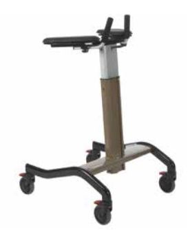
Pull up Hydraulic Pull up lever to adjust to required height.